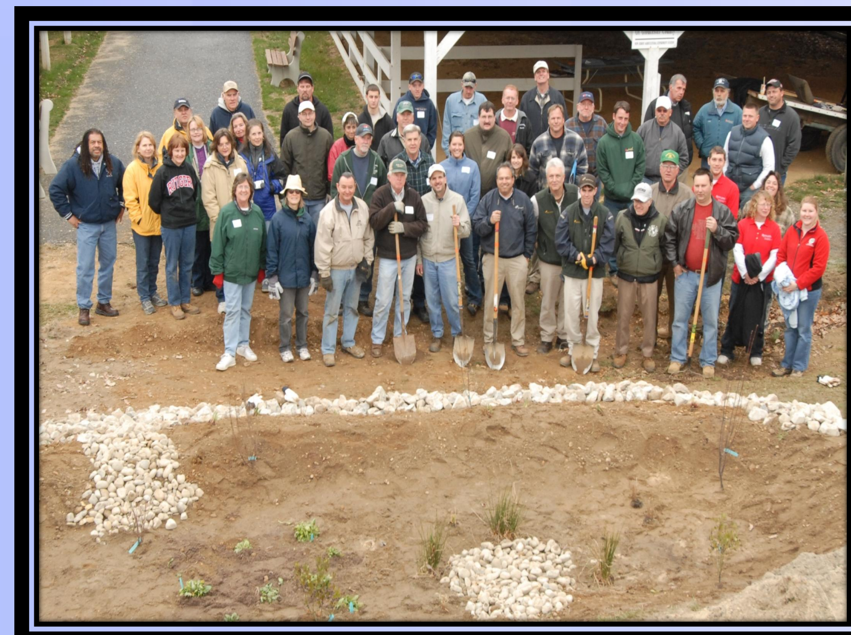
Program Participants in South Jersey

"I am looking forward to using rain gardens as much as possible. I am excited about our going green choices." - Program Participant