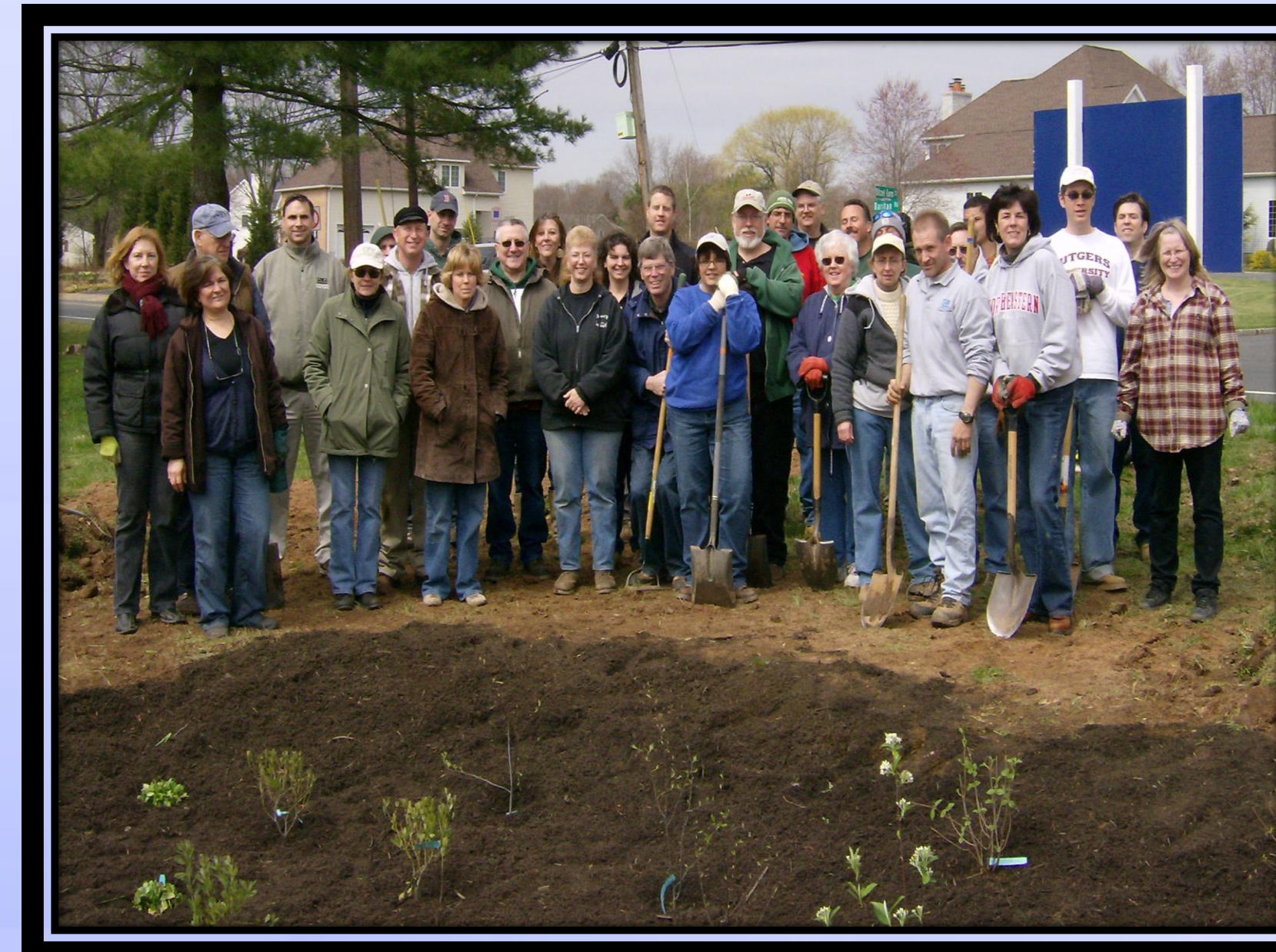
Program Participants in North Jersey

"I plan to use today's information to create better residential designs and master plans which incorporate rain gardens to address the discussed water issues." - Program Participant